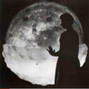
Will Burtin's Six-Foot Human Cell (1958).

Atomic Structures: The Architecture of Nuclear Nationalism in India and Pakistan